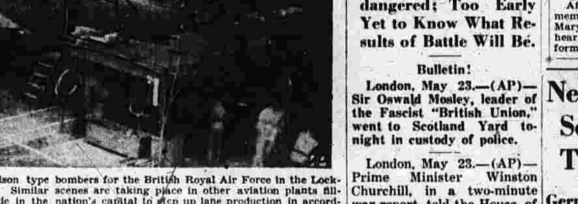
Workers are shown assembling Hudson type bombers for the British Royal Air Force in the Lockheed Aircraft plant at Burbank, Calif. Similar scenes are taking place in other aviation plants filling foreign orders as plans are being made in the nation's capital to speed up late production in accordance with President Roosevelt's defense program in which he asked for an air force of 50,000 planes, and an output of that many annually.