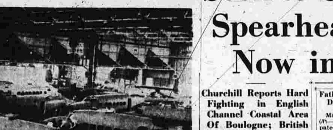
Full Speed Ahead for Britain-Bound Bombers

Basel, May 23.—(AP)—Germany and France, apparently getting all the strength they can spare into the battle in the west, have withdrawn almost all of their motorized veteran division from the Swiss frontier.